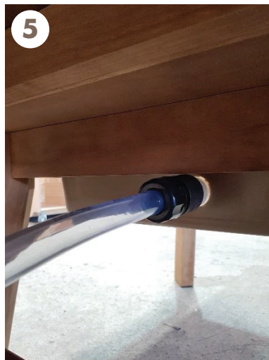
5 Once tub is in place, simply connect the hose together. Ensure you hear it 'CLICK' into the locked position. To release, pull on the outer sleeve, just like a standard garden hose.