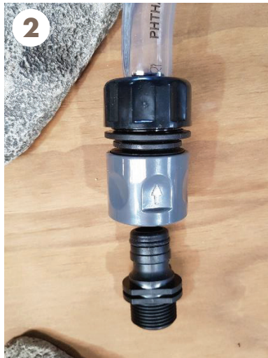
2 Disconnect the male threaded hose fitting from the female quick connector.