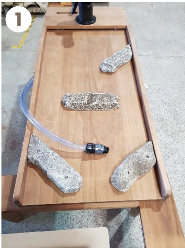
1 Hose shown connected at pump end.