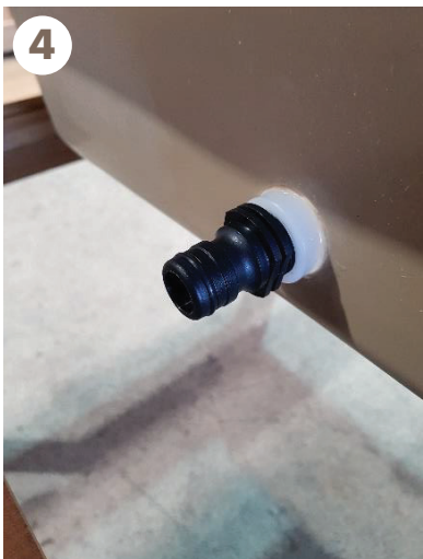
4 Male fitting shown correctly in plastic tub.