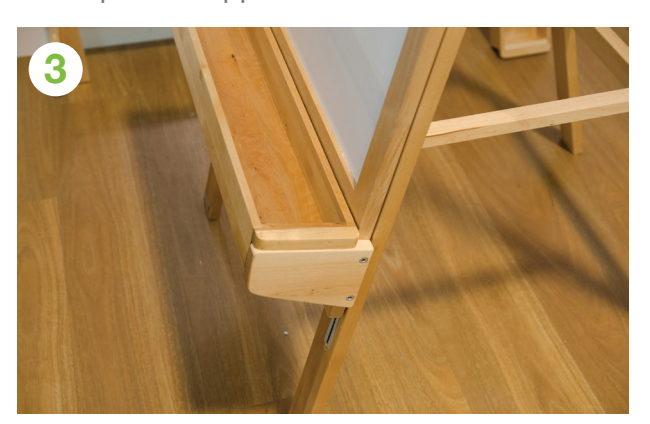
Portable paint holder trays can now be placed onto paint holder brackets as shown.