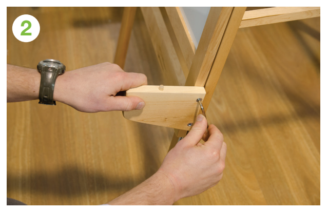
Assemble paint holder brackets with woodscrews into the pre-drilled holes on the side of the easel and repeat on remaining sides.