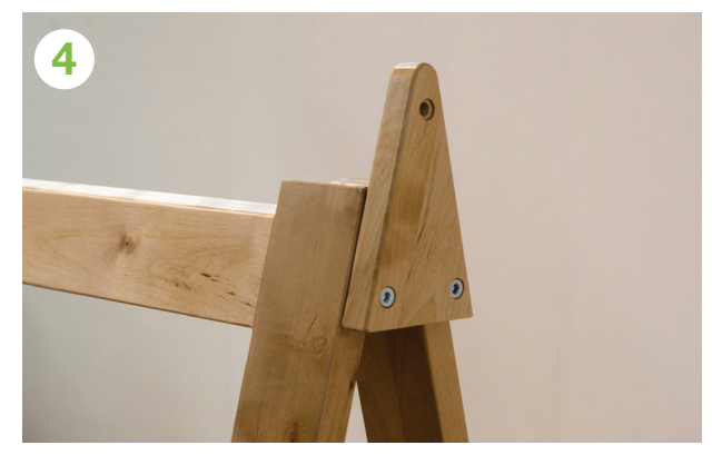
Assemble one paper roll holder bracket using woodscrews into the pre-drilled holes on the top of the easel.