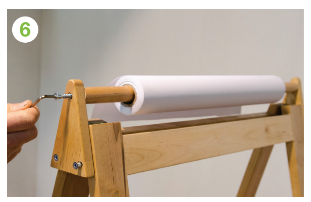
Slide on paper roll and repeat steps 4 and 5.